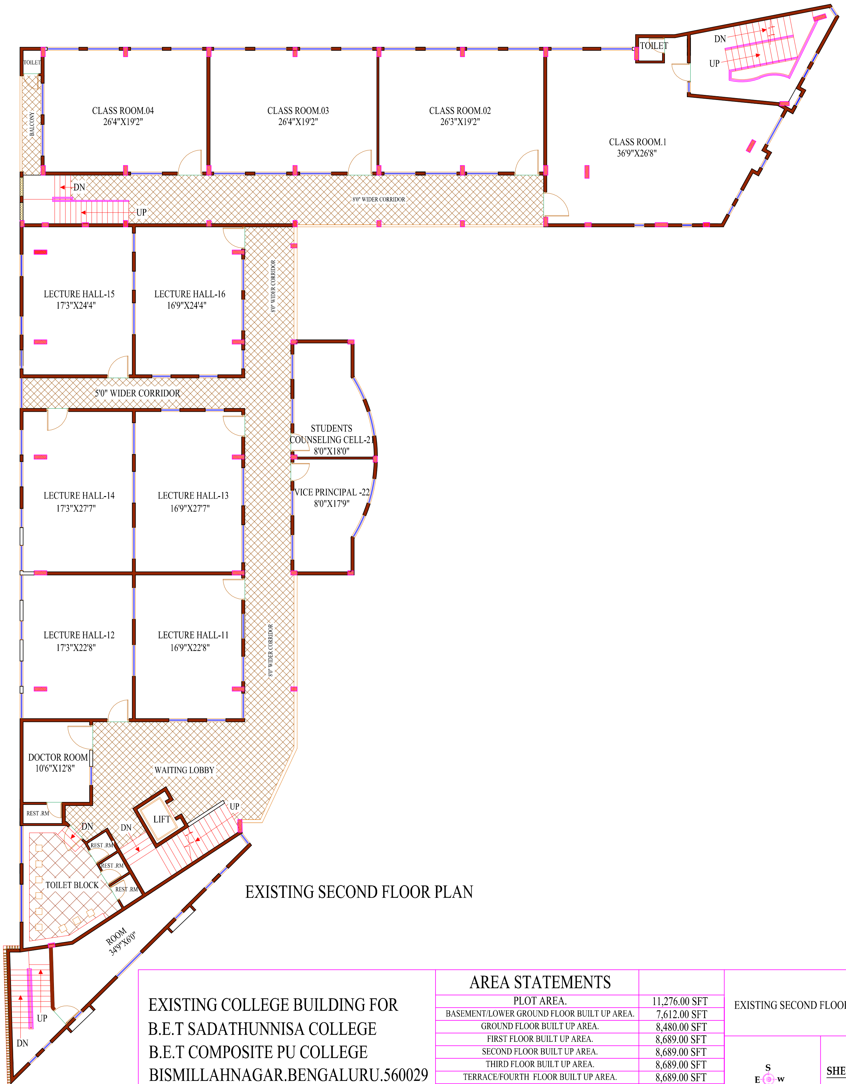
EXISTING SECOND FLOOR PLAN

EXISTING COLLEGE BUILDING FOR B.E.T SADATHUNNISA COLLEGE B.E.T COMPOSITE PU COLLEGE BISMILLAHNAGAR.BENGALURU.560029